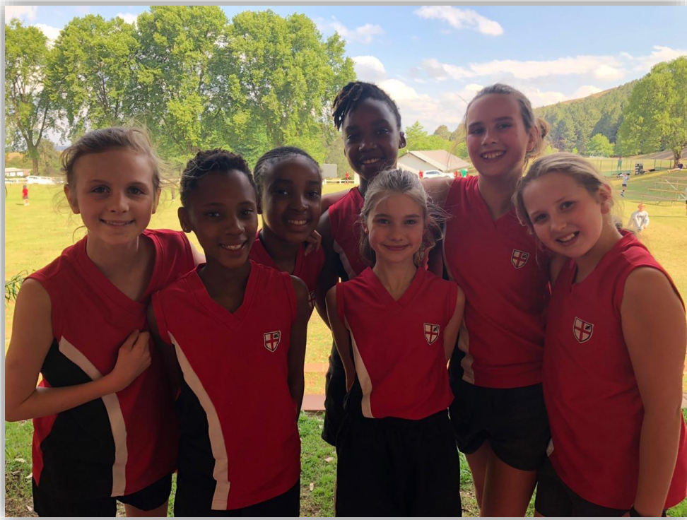
U11 Basketball Team who played against St John's